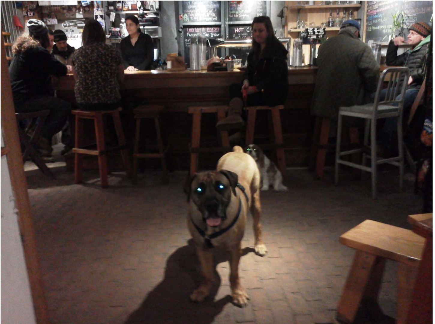
Buster at a winery on Martha's Vineyard.

By these dogs being in the Hall of Fame group, does not distract from all of the other hundreds of wonderful dogs which have been saved by DEAR & Crossdogs.