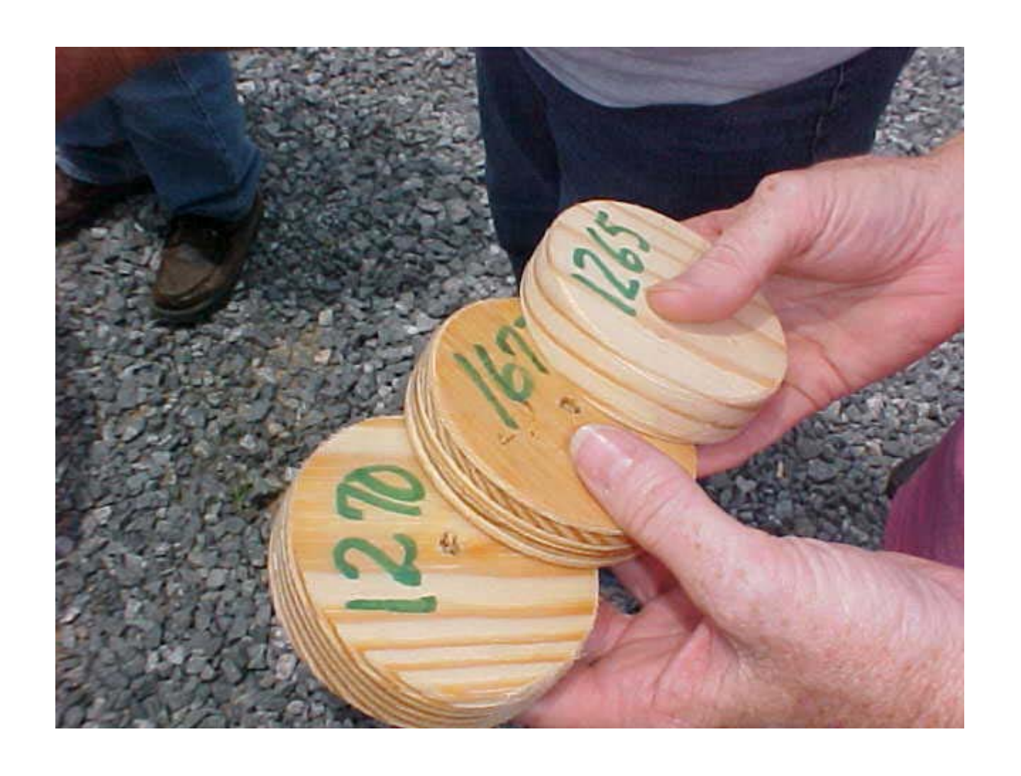
The three winning "boats".