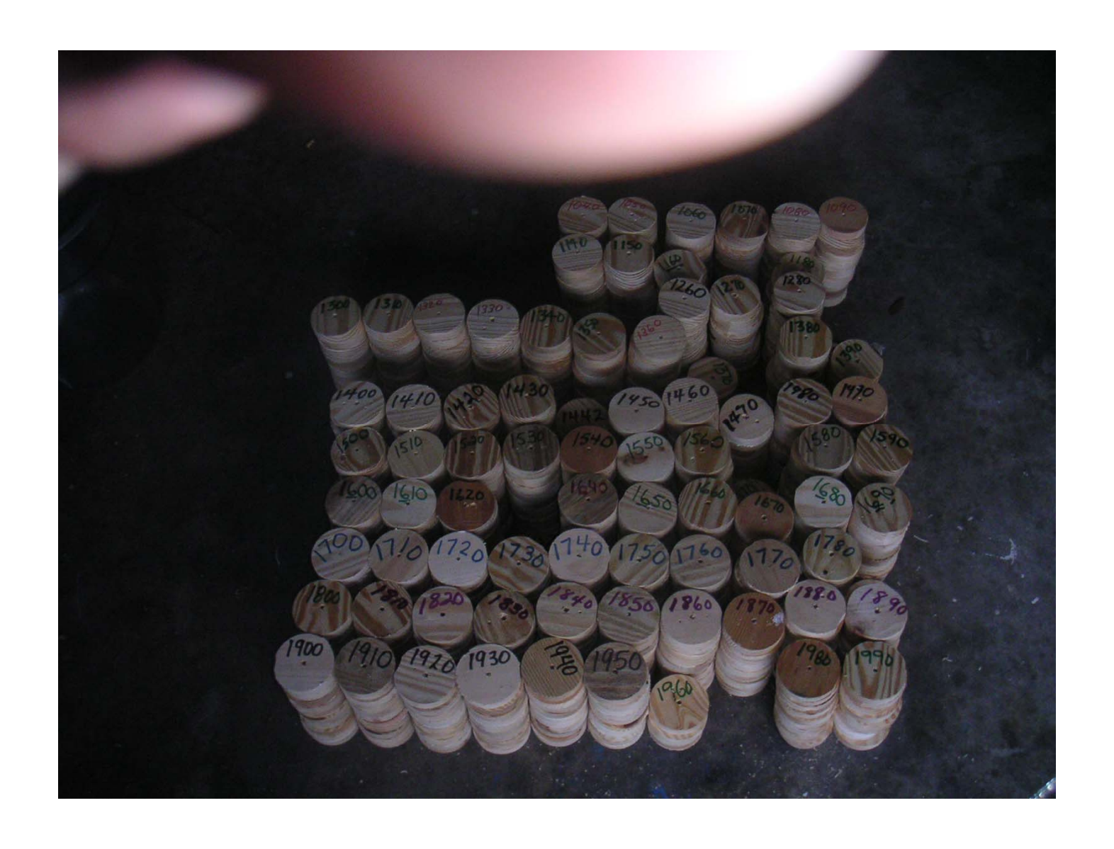
The "boats" before the race begins.