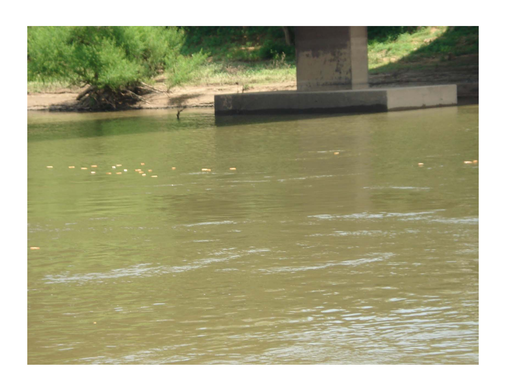
The race is on. Boats floating under the Roanoke River bridge at Scotland Neck.