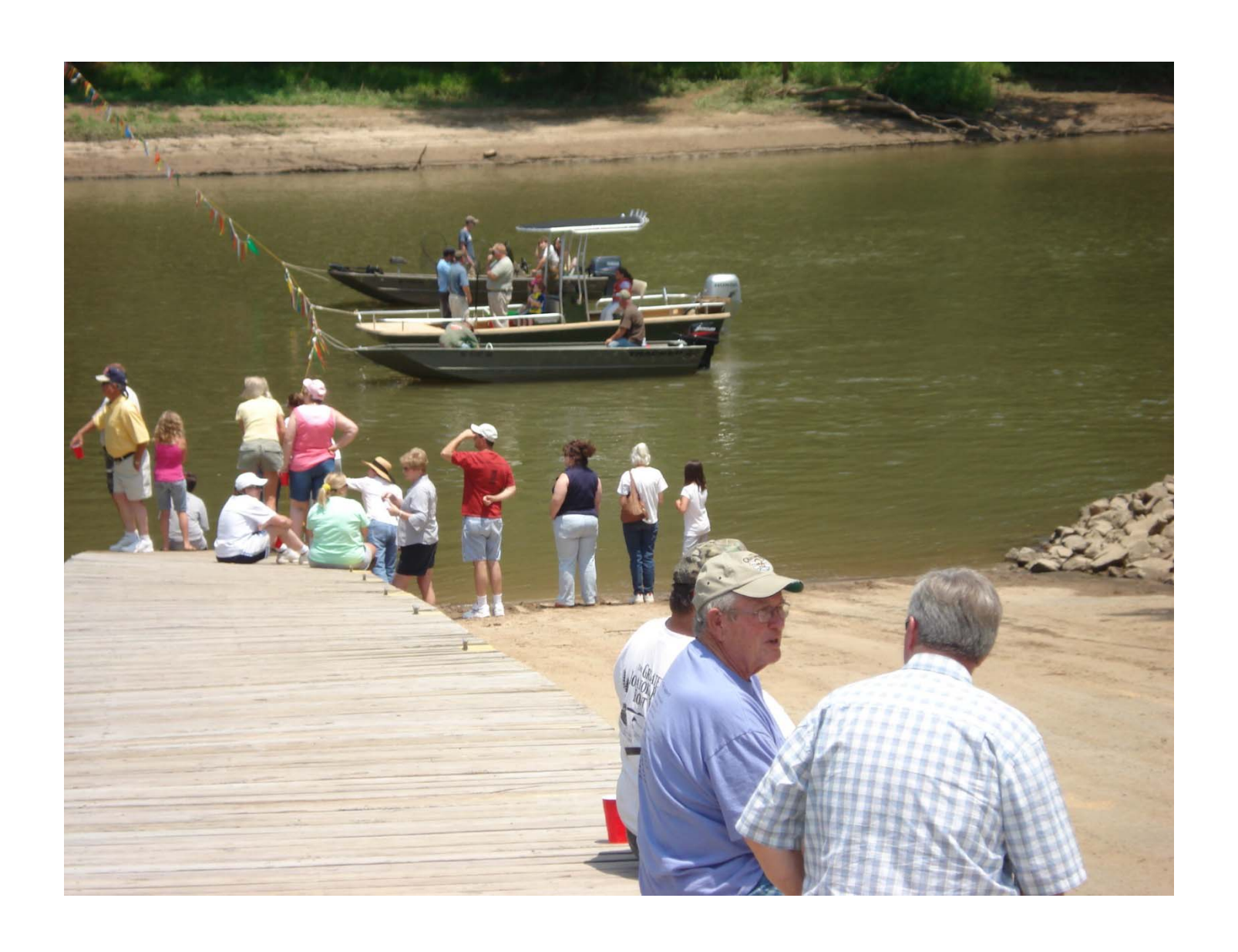
The finish line.