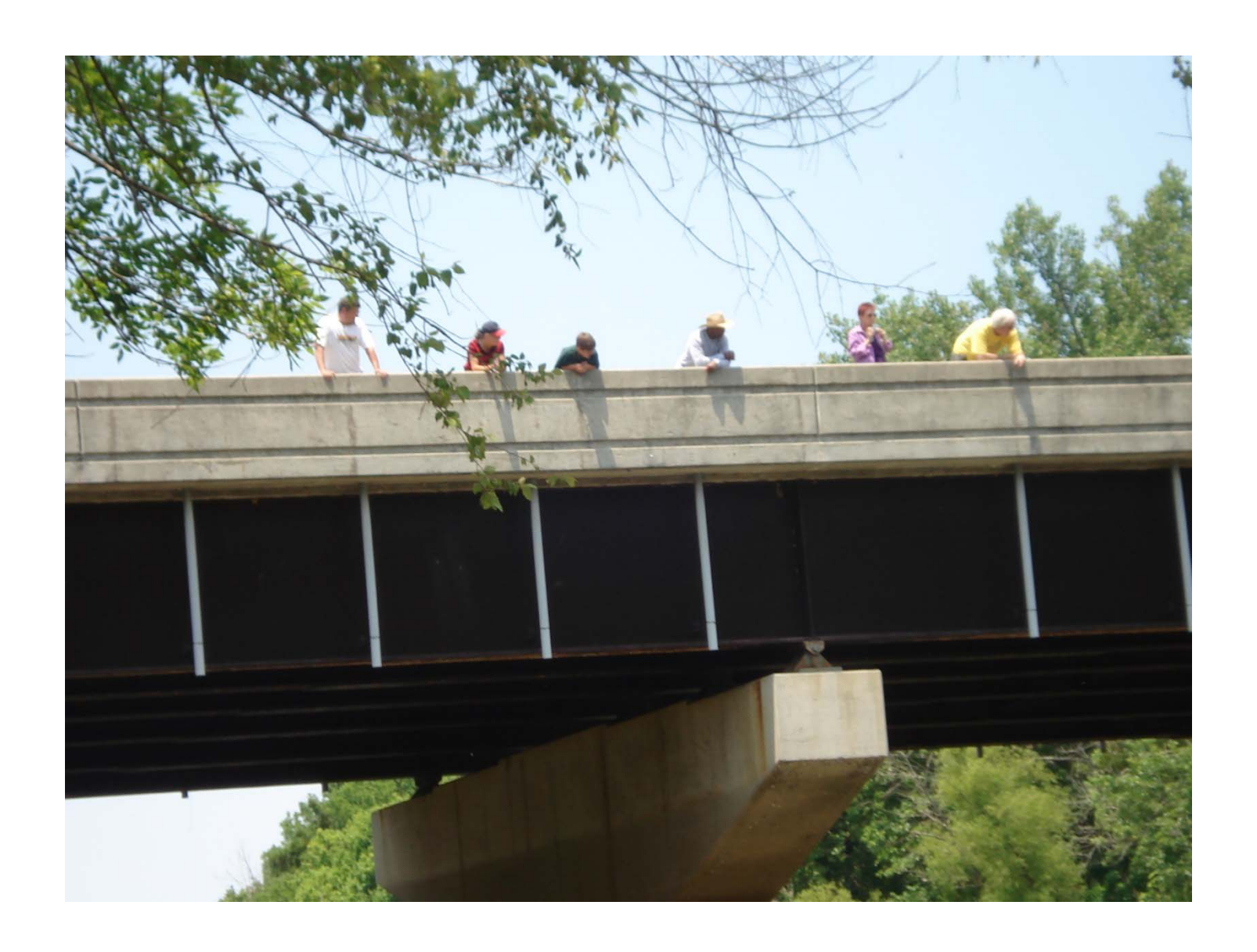
Boat owners & spectators on the bridge watching the race.