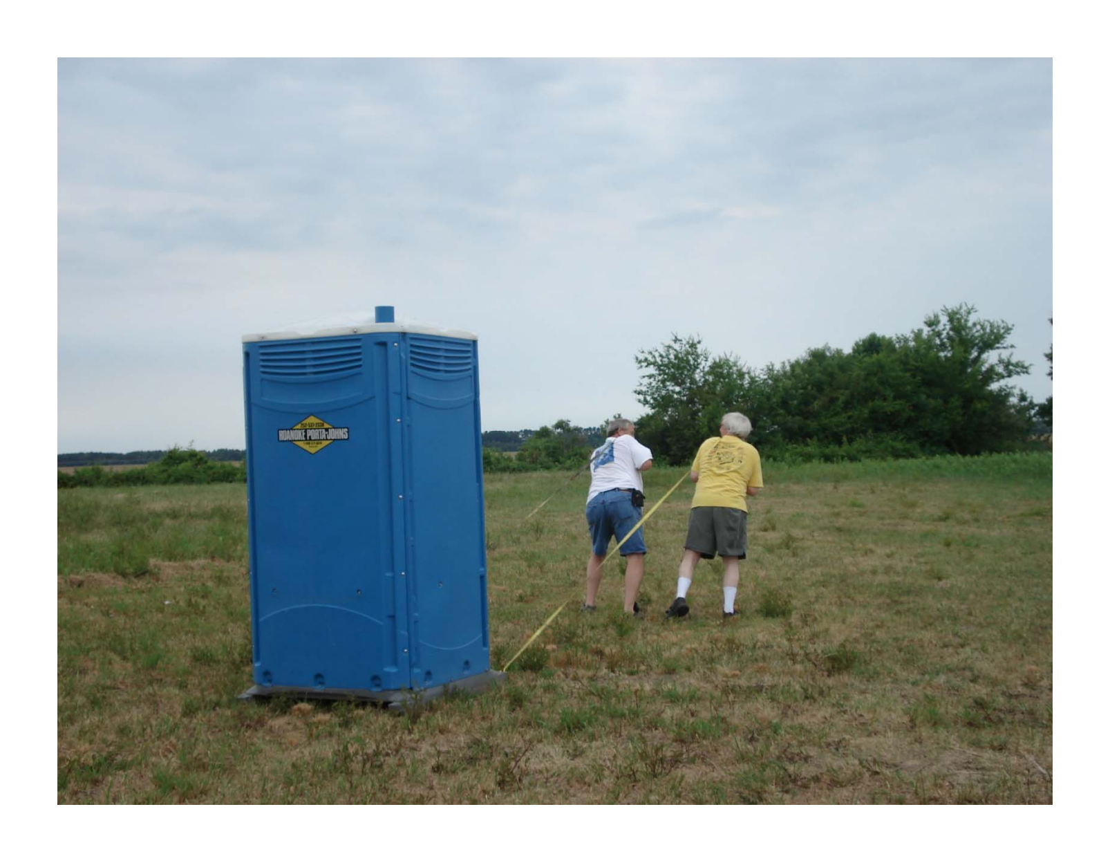
Every event has its dirty details.