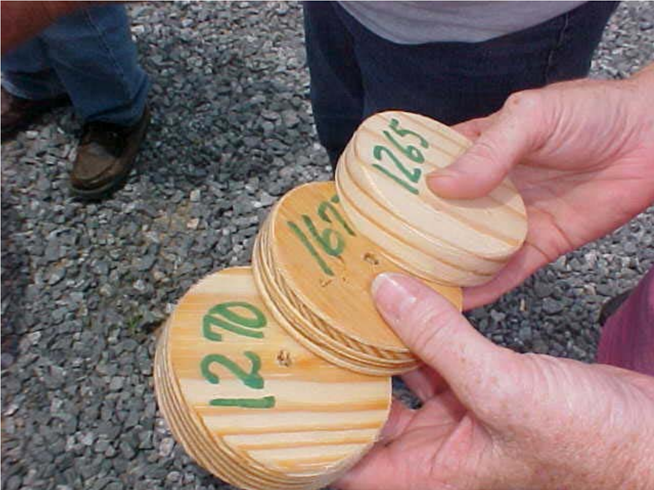
The three winning "boats".