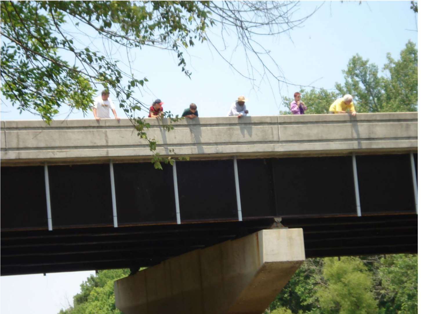
Boat owners & spectators on the bridge watching the race.