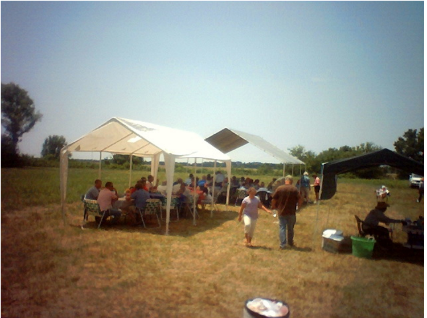
Some of the “boat owners” enjoying a seafood meal before the race.